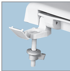
NON-CORROSIVE BOLTS AND WING NUTS (1900)