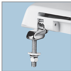
300 SERIES STAINLESS STEEL SELF-SUSTAINING HINGES (1900SS)