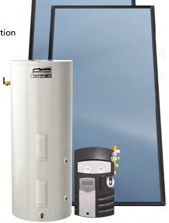
Model shown SSX62-ACI-220