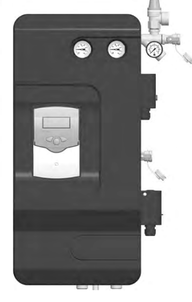
Double Wall Pump Station