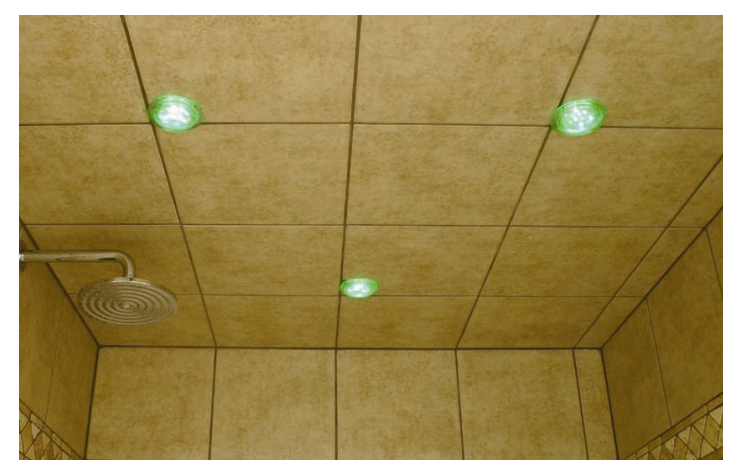
Chromatherapy Light Kit

Not intended for use as installation instructions. Refer to specific installation instructions for further detail.