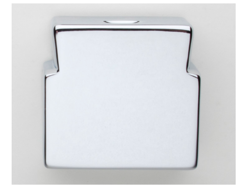
ComfortFlo Steam Head