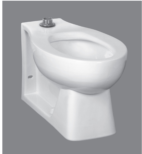
SEE REVERSE FOR ROUGHING-IN DIMENSIONS