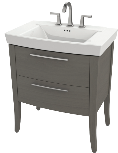
Townsend pedestal top sink 0328.008 shown with 9036.030 vanity and 7760.000 drawer pulls