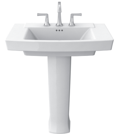
Townsend pedestal combination 0328.800