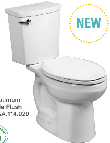
H 2 Optimum Single Flush 288AA.114.020