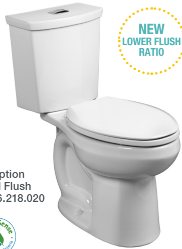
H 2 Option Dual Flush 2886.218.020