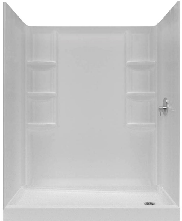
2946.SW Studio Shower Wall Set shown with 2946.STR shower base