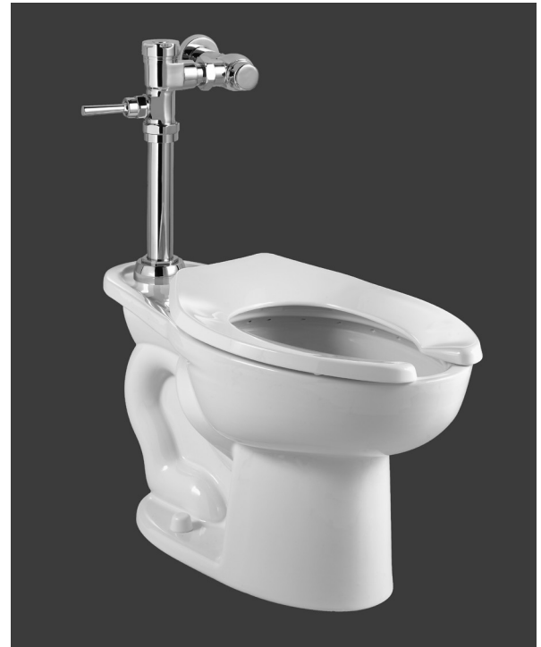
SEE REVERSE FOR ROUGHING-IN DIMENSIONS