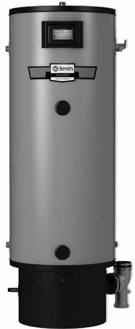
MODEL SHOWN GTP-199 SERIES 200/201

*When sized appropriately. Model GTP 199 can deliver 6.95 GPM continuous flow, based on 65°F inlet water temperature, 120°F outlet temperature.