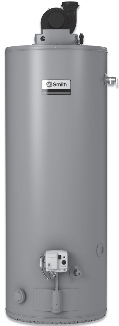
BTF-80 SERIES 210/211