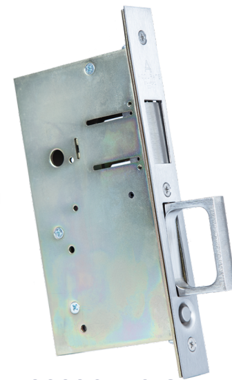
2002CPDS-Q POCKET DOOR STRIKE WITH PULL ONLY