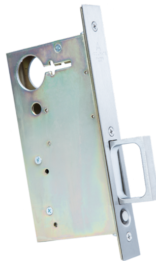
2002CPDP-Q POCKET DOOR WITH PULL ONLY