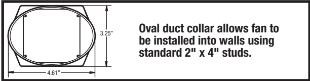
Oval duct collar allows fan to be installed into walls using standard 2" x 4" studs.

Box Dim: 11 1 / 16 " x 14" x 6 3 / 16 " UPC: 0-8316294157-2 Shipping Weight: 5 1 / 4 lbs. Available in contractor packs of 4 housings - model BFQ2HSG