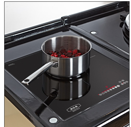
9" x 9" Defined Pan Area