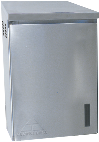
WCH-15-24 Left Hinged Shown (Standard)*