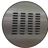
Vented Side Panels