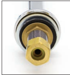
BOTTOM VIEW 1/2" NPS MALE INLET

Brass chrome plated body & spout. Chrome plated handles.