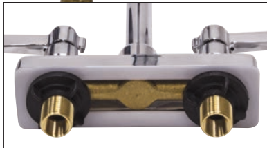
BOTTOM VIEW 1/2" NPS (OUTSIDE THREAD) 3/8" NPT (INSIDE THREAD)