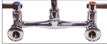
BACK VIEW 1/2" NPT(INSIDE THREAD)

FAUCET AERATOR CONFORM TO ASTM.A112.18.1M • 1.0 GPM/3.8 LP THREAD: 55/64 - 27 FEMALE