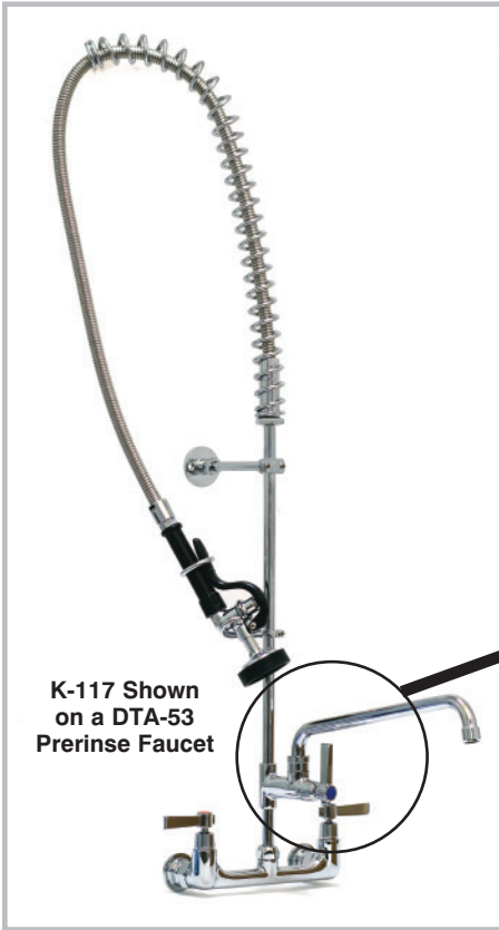
K-117 Shown on a DTA-53 Prerinse Faucet

For Use With DTA-53 Prerinse Faucet Only Conforms To NSF 61/9 Lead Free Requirements