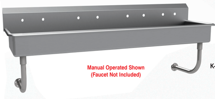
Manual Operated Shown (Faucet Not Included)