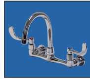
"-F" Series Sink Includes K-161-LU Gooseneck Faucets with Wrist Handles