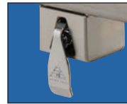
Knee Valves Included On All "KV" Models