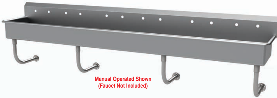
Manual Operated Shown (Faucet Not Included)