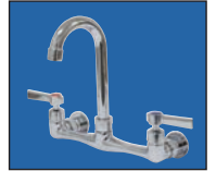
"-F" Series Sink Includes K-159 Gooseneck Faucets