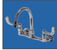
"-F" Series Sink Includes K-161-LU Gooseneck Faucets with Wrist Handles