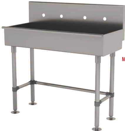
Manual Operated Shown (Faucet Not Included)